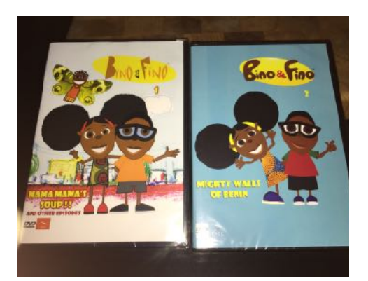
There was enough material to use

Now that was a fun, creative and challenging workshop! First we watched a cartoon called "Bino & Fino" by a Nigerian artist. Using that as inspiration, we ask the children to work in groups, think of a short story, each one of them to draw a part of the story and at the end put the whole story together. The children were totally free in how they wanted to approach the assignment. It was wonderful to see how much fun they had and how easily they were able to agree on the roles each of them would take in order to make a fun cartoon! Of course all the handwork was rewarded :-) Thank you to Thati and Vivianne for organising the workshop.