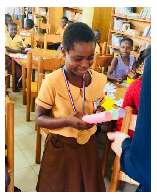
Congratulations! First prize :-)