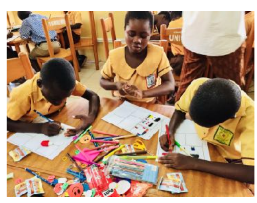
Who does what?