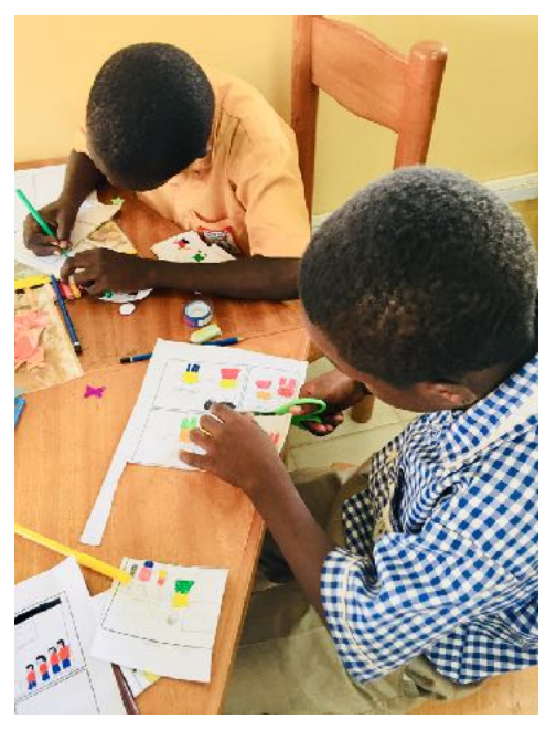
Putting the Cartoon Together