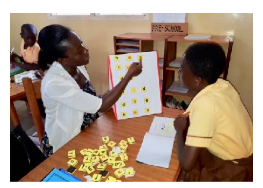
Support us! <a href="http://bit.ly/2naoc4w">http://bit.ly/2naoc4w</a>