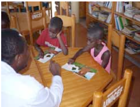
a reading class at Takoradi Centre