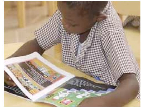
Simply wonderful to watch