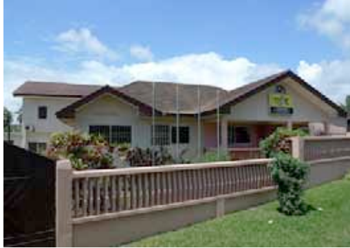
Takoradi Centre in it splendour