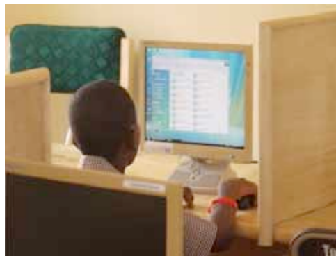
ICT classes taking of in Cape Coast