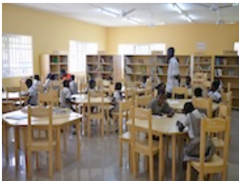
Library at Cape Coast Centre