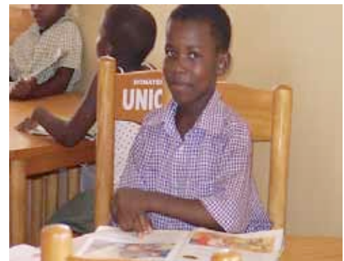
Enjoying his book