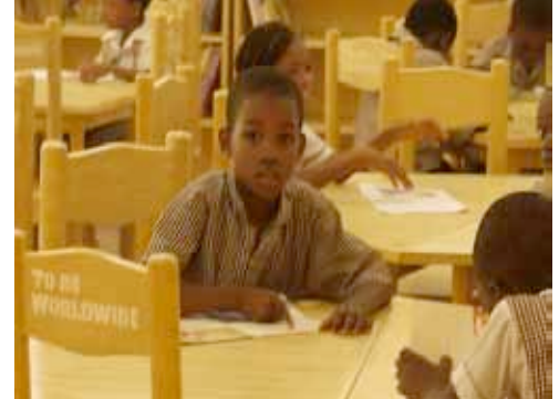
so sorry to have disturbed you.....