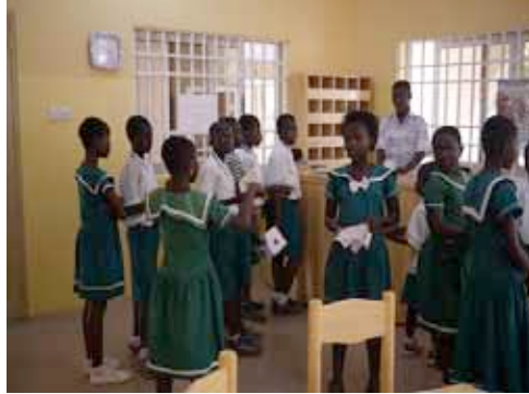
Kids queuing at Cape Coast Centre Library