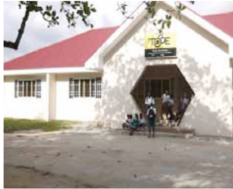
Hanging out at the Centre in Cape Coast