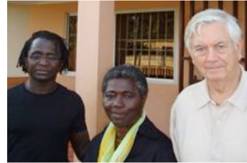
Mr. Frits Bolkestein visits TBWW Ghana