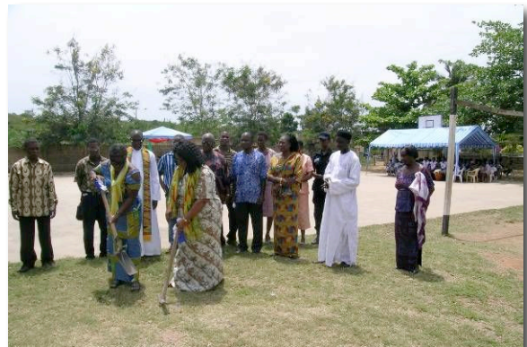
Ground breaking ceremony in Cape Coast

The plot is 40 x 40 meters and belongs to private owners who run a Montessori primary and junior secondary school on the adjacent plot. This will allow their students to use the Centre as well. To Be Worldwide has signed a Memorandum of Understanding (M.O.U) with the owners of the land giving us a lease on the land for 99 years and the right to an extension. A representative of the District Assembly witnessed the signing of the M.O.U.