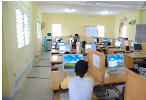
Daily compute Classes