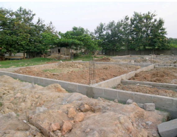
The foundation walls

To Be Worldwide has received funds from Turing Foundation, Fondation Les Paquerettes, Wilde Ganzen and the Western Union Foundation to build the Centre. The contractor who has taken on this task is the same company who built the Centre in Takoradi. The groundbreaking ceremony and the laying of the foundation took place in October/November 2008. We expect the building to be completed late summer 2009.