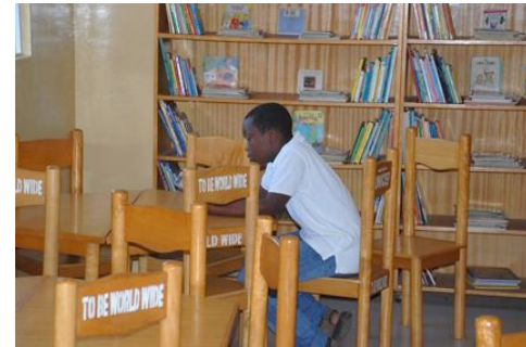
Some quite reading time