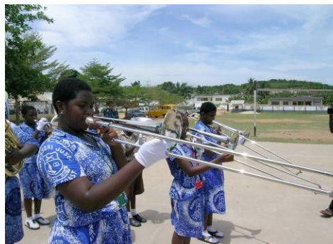
Brass band at the ceremony