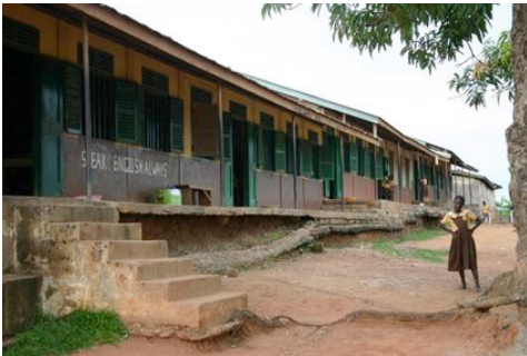
One of our partner schools