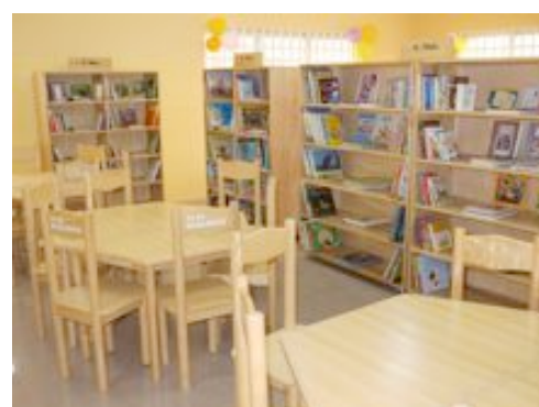
Library of Cape Coast Centre