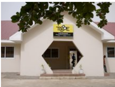
Cape Coast Centre entrance