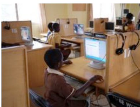
IT Classes at Takoradi Centre