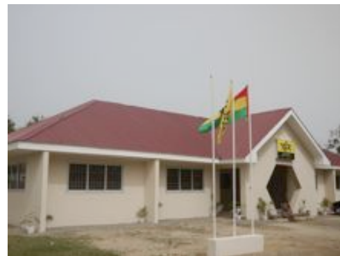
Proud to present the Cape Coast Centre