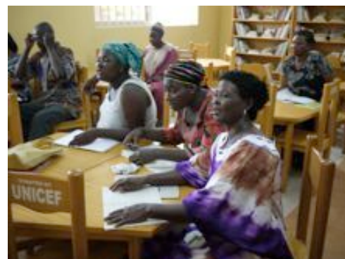
Adult Literacy Classes continue