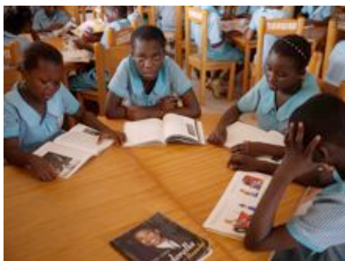
Children visit library with whole class