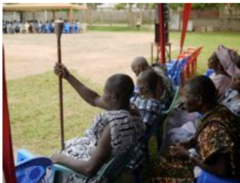
Chiefs of Pedu at opening event