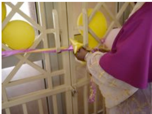
Official cutting of the ribbon